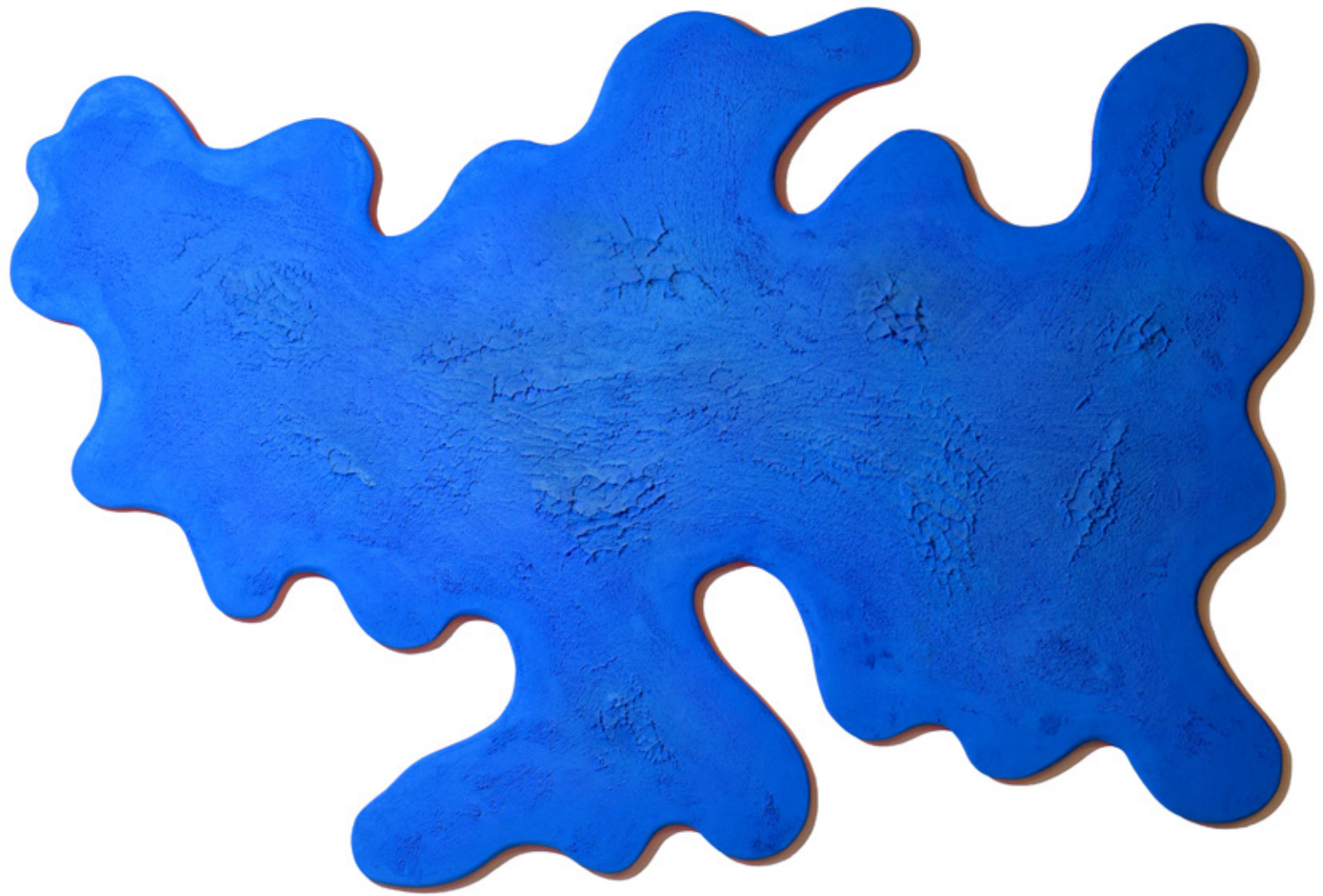
CHARGE α57431 - ACRYLIC, EPOXY, SILICA, WOOD - 240 x 160 cm - 2017