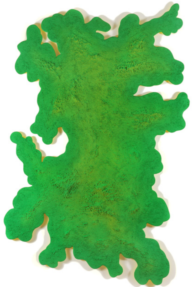
CHARGE α360197 - ACRYLIC, EPOXY, SILICA, WOOD - 230 x 145 cm - 2015