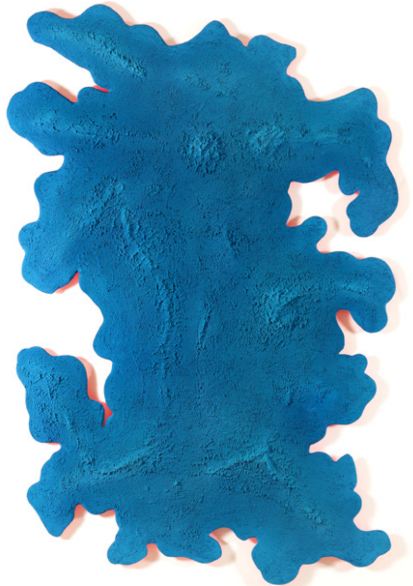
CHARGE α847225 - ACRYLIC, EPOXY, SILICA, WOOD - 225 x 150 cm - 2015