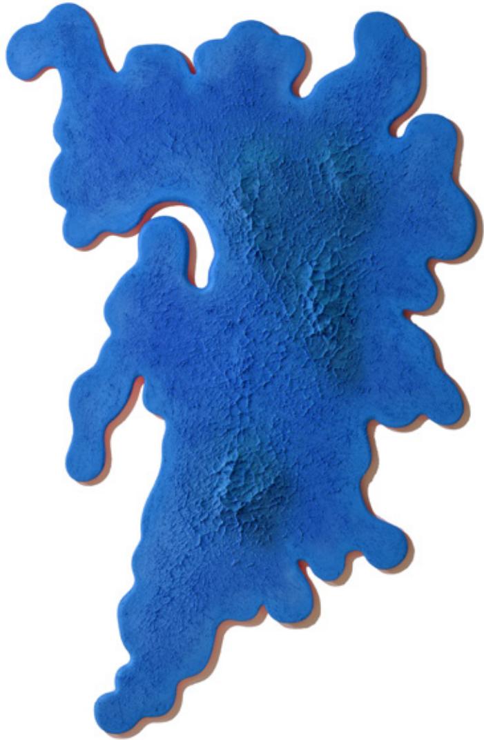
CHARGE \alpha 4603 - ACRYLIC, EPOXY, SILICA, WOOD - 150 x 100 cm - 2017