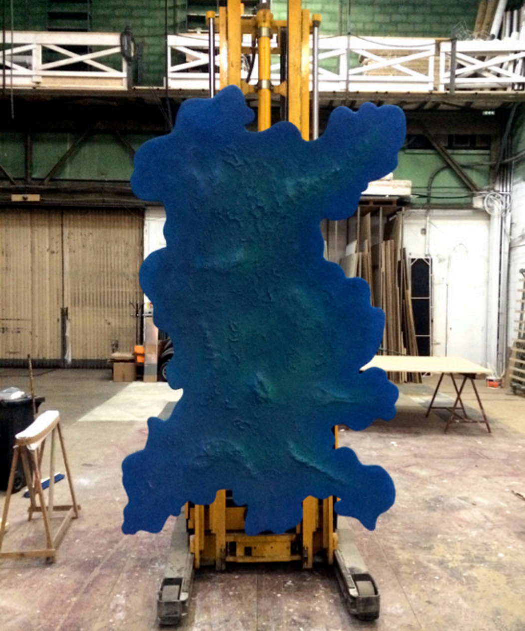
CHARGE α473983 - 220 x 130 cm - STUDIO VIEW - 2015