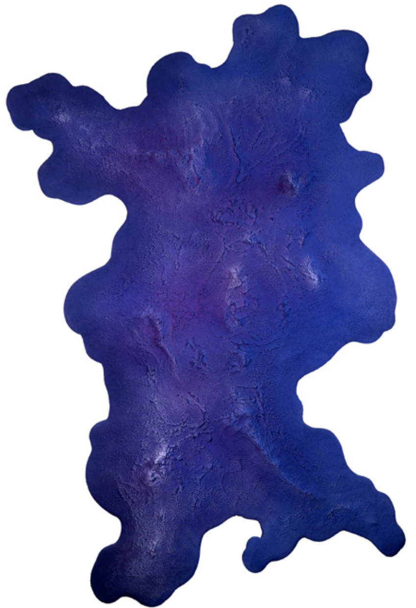
CHARGE α186517 - ACRYLIC, EPOXY, SILICA, WOOD - 220 x 140 cm - 2015